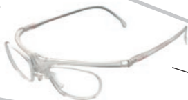
XKROSS 2 BIKE PRO Panorama Shield

Additional frame in which the Rx-able optical Inner frame can be easily clicked into the After Sports glasses frame.